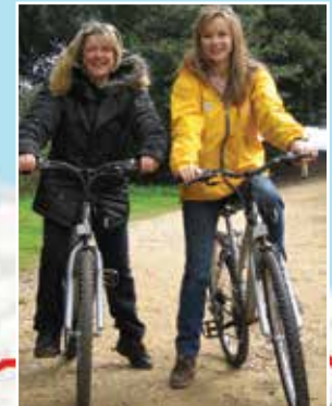
Amanda Holden and friend enjoying a day's cycle hire from 'On Yer Bike'

Most of the Norfolk Coastal Footpath is for pedestrians only and neither accessible or safe to cycle with the exception of the stretch between Wells Next The Sea and Holkham beaches which is suitable to cycle as part of our Wells and Holkham Circuit.