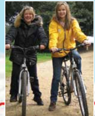
Amanda Holden and friend enjoying a day's cycle hire from 'On Yer Bike'

Most of the Norfolk Coastal Footpath is for pedestrians only and neither accessible or safe to cycle with the exception of the stretch between Wells Next The Sea and Holkham beaches which is suitable to cycle as part of our Wells and Holkham Circuit.